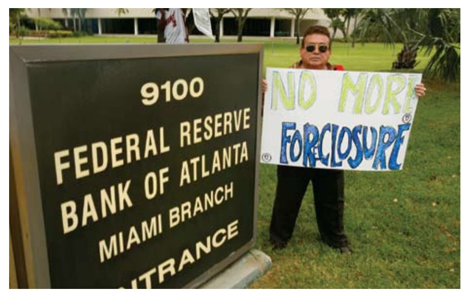
Government Lifeline? ACORN stages a protest in front of the Federal Reserve Bank in Doral, Florida.

past progress, however. Less affluent communities are particularly vulnerable to the combination of job losses and mortgage foreclosures. Meanwhile, banks are focused internally on cutting cost, trimming every possible product and service that cannot turn a profit, and improving the credit performance of their portfolios through much tougher underwriting standards. The need for financial-sector reform and for public policy to be responsive to the potentially disproportionate impact on these communities is urgent.